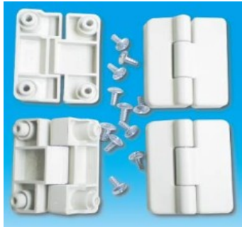
Name: Plastic hinge Part No.: AC021 Dimensions: 50*40(mm) Material : PC