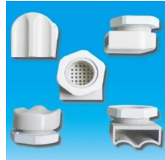
Name: Plastic radiator Part No.: AC022 Material : PC