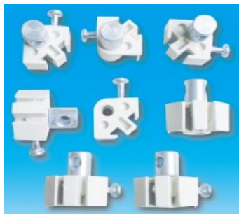
Name: Activity support Part No.: AC025 Material : PC