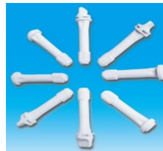
Name: Plastic screw Part No.: AC026 Dimensions: M12[M14]*5mm Material : POM