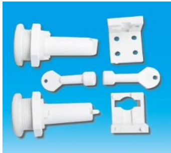
Name: Plastic lock Part No.: AC023 Material : PC