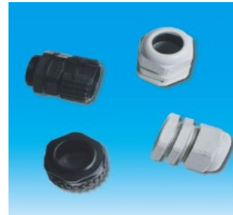
Name: Plastic waterproof connector Part No.: AC024 Material : PA